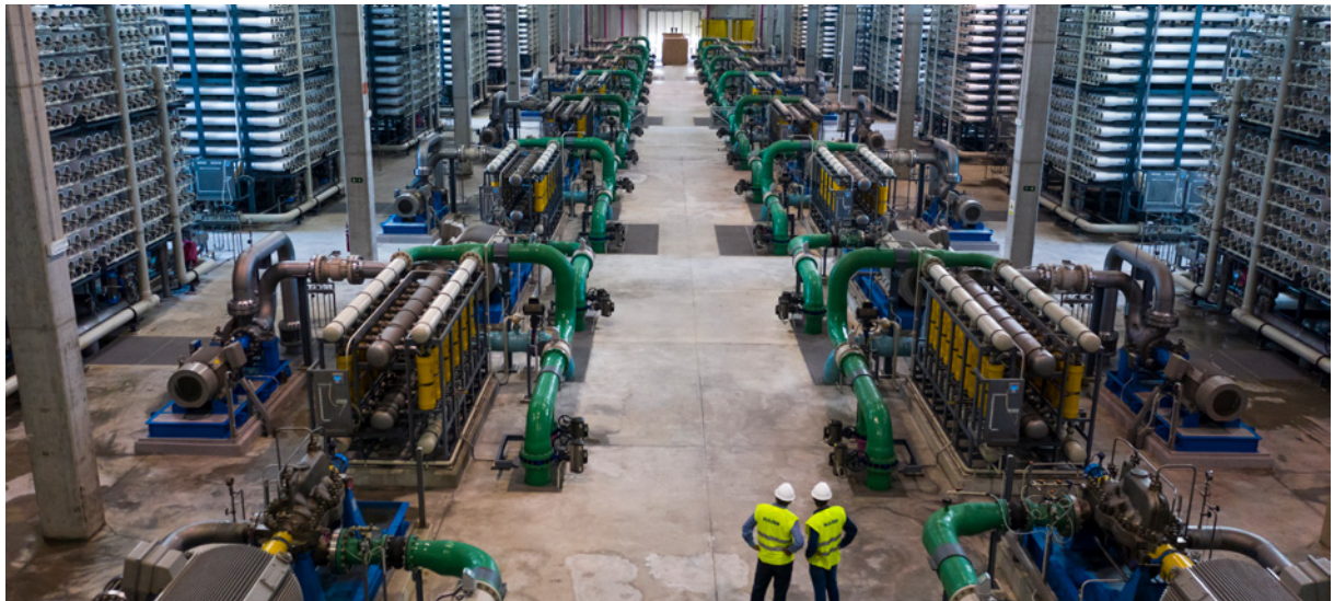
Pump efficiency increases with larger RO trains.

The desalination sector is continually advancing, with incremental improvements in scale, efficiency and reliability. Each new project aims to reach the limits of performance, and every year the sector finds ways to push those limits just a little further. As a leading player in the pump industry and a longstanding partner to the sector, Sulzer is proud to play its own part in that ongoing improvement process. Ultimately, everyone has one common goal: delivering more affordable fresh water to the people that need it most.